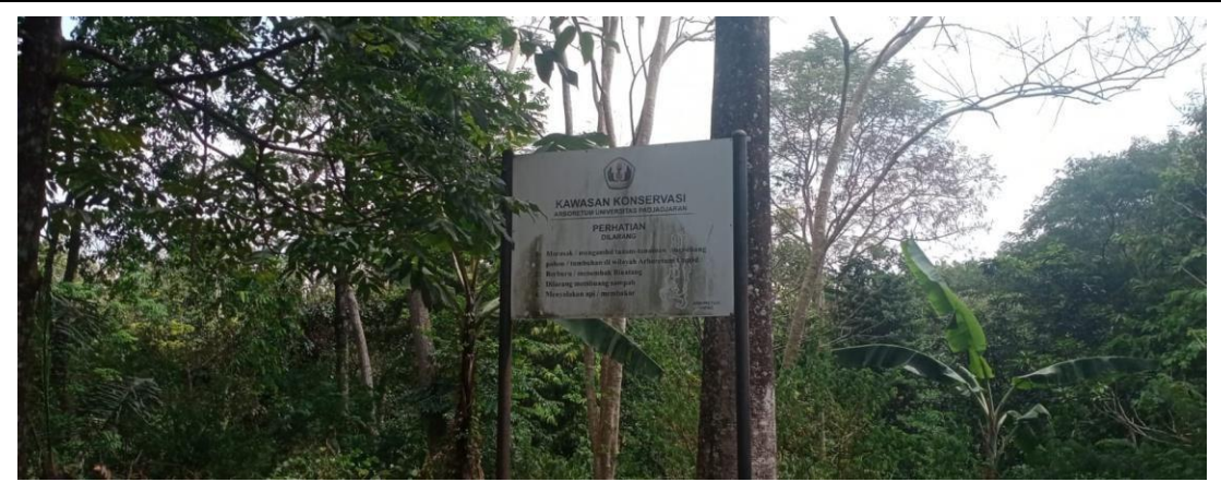
Arboretum - Rare plant zone