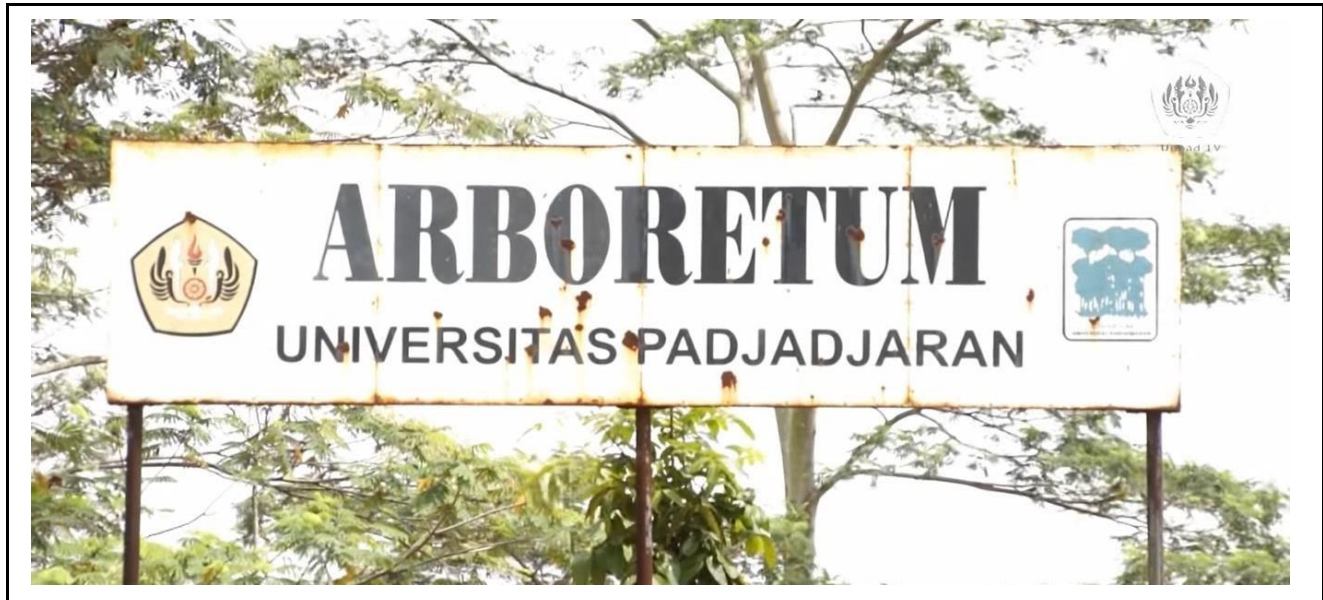
Conservation Area: Arboretum