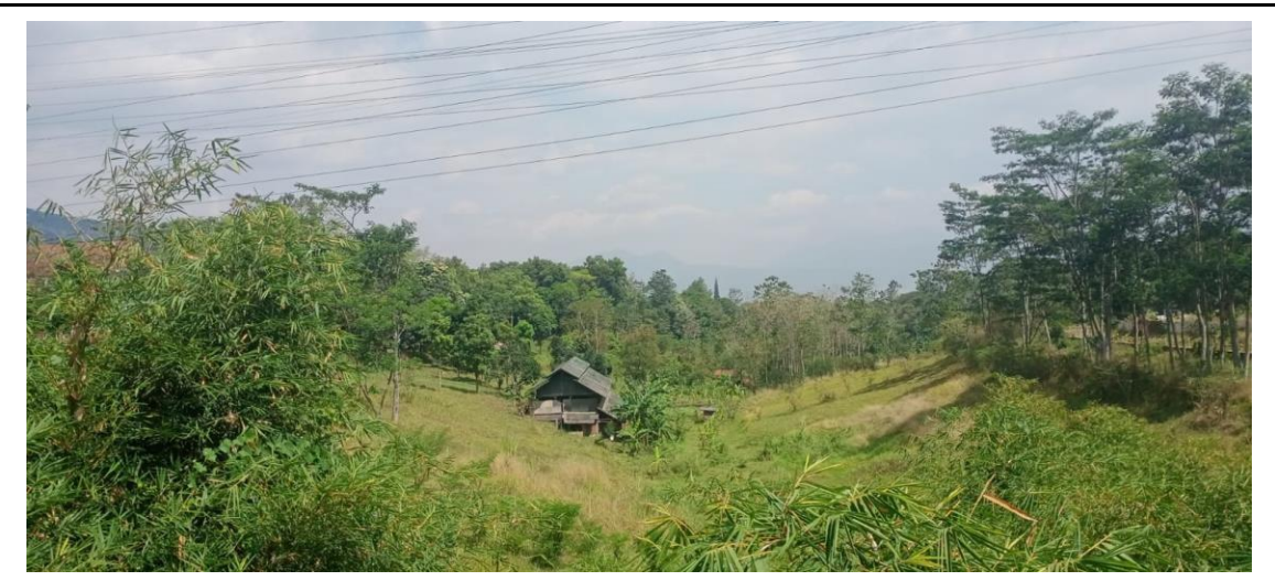
Arboretum - Food crop zone