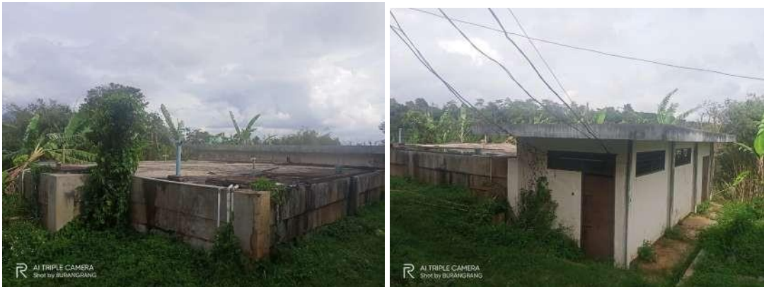
Main water reservoir