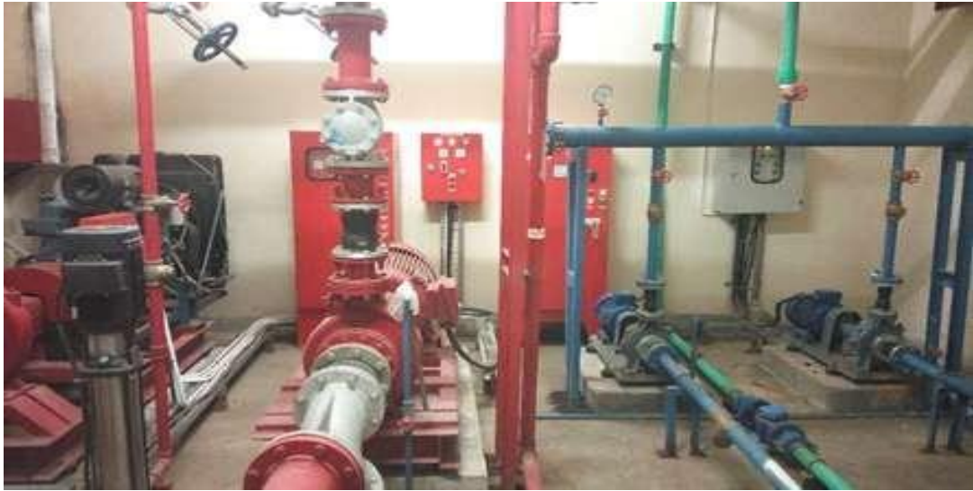
Deep well water installation