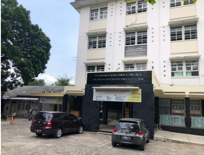
Balai Kesehatan Unpad Bandung