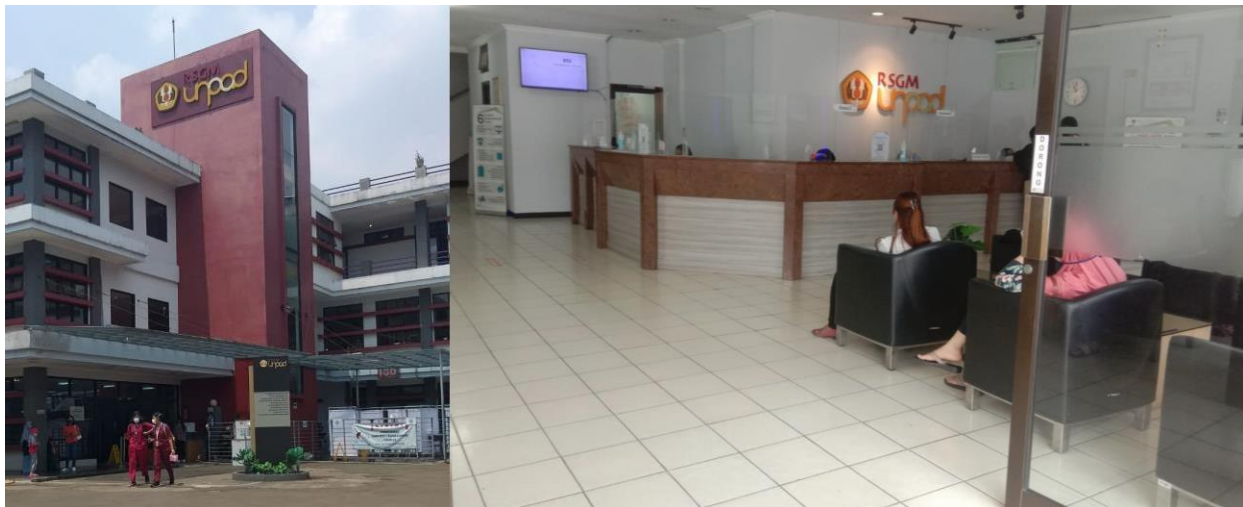
Rumah Sakit Gigi dan Mulut Unpad