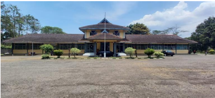
Balai Kesehatan Unpad Jatinangor