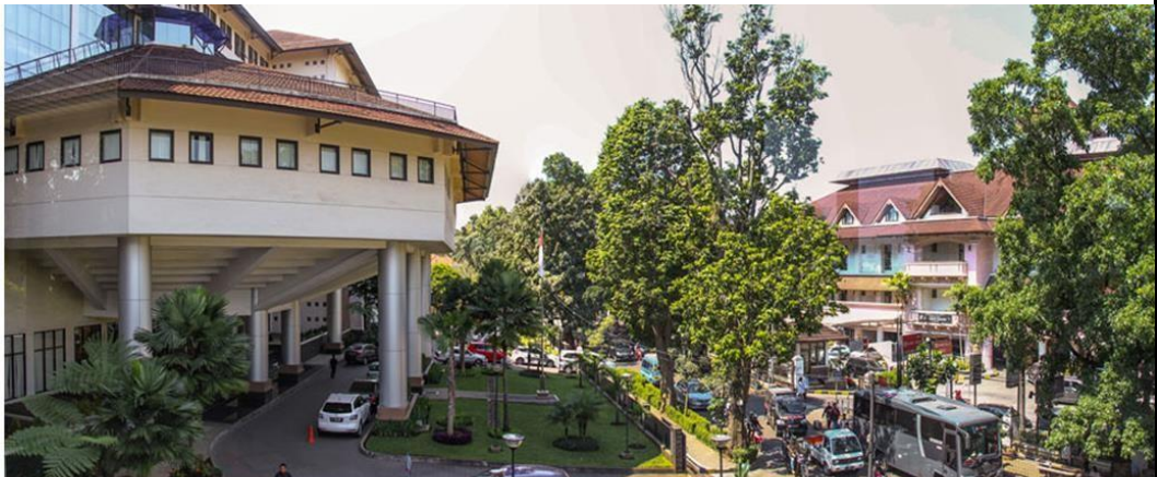
Gedung Rumah Sakit Pendidikan UNPAD Jalan Eijkman No. 38 Bandung