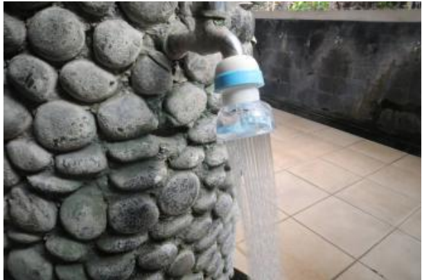
Water saving faucet