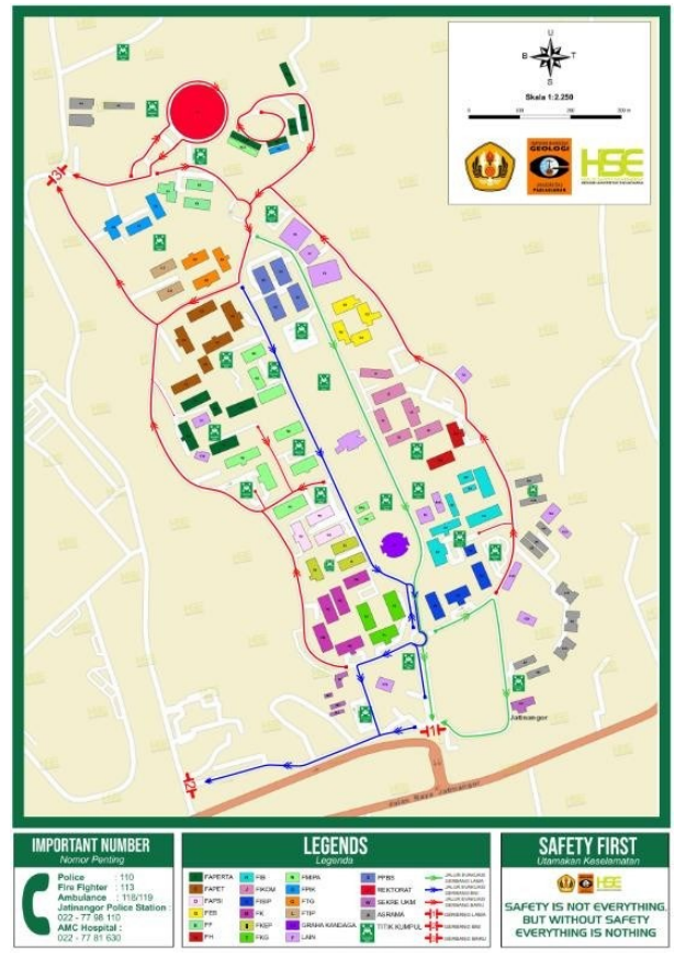
(ERP) Evacuation Route Plan Map