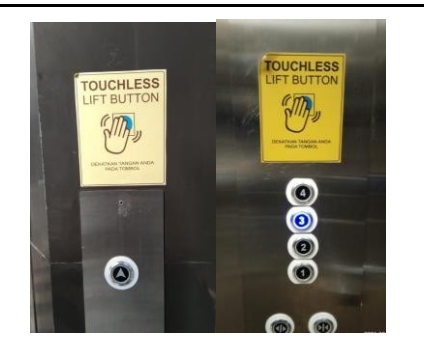
Use of lift buttons with sensors