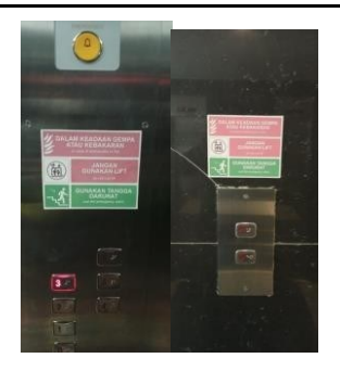
Warning in the elevator