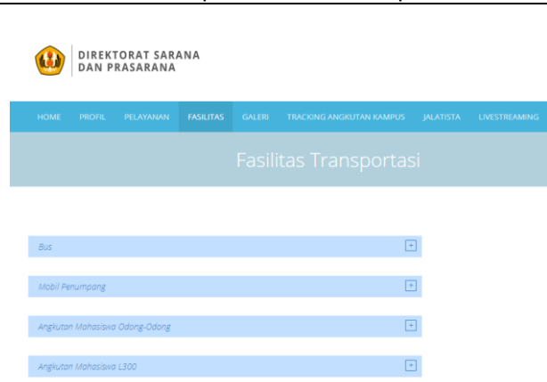
Campus transportation facility website