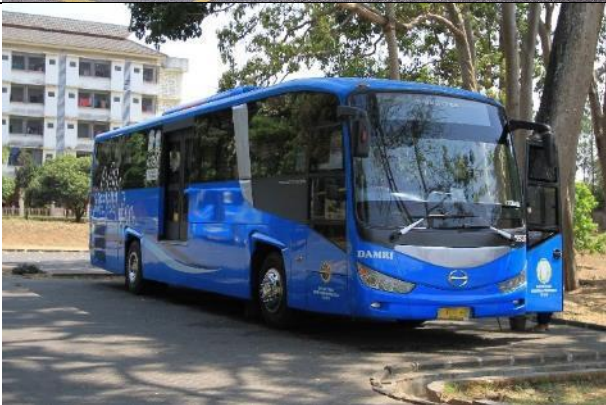
Damri Bus (Transportation for employees)