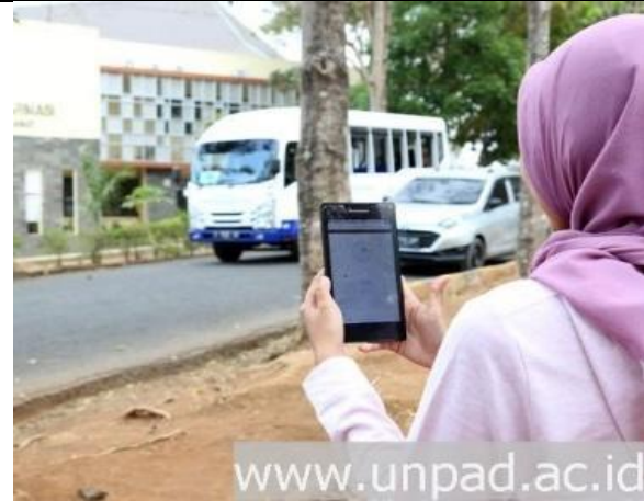
Track campus shuttle via cellphone