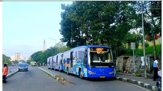
Damri Bus Shelter. Route : Bandung (Dipatiukur) – Jatinangor dan Bandung (Elang) – Jatinangor