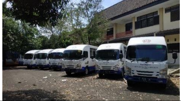
Universitas Padjadjaran Campus Shuttle