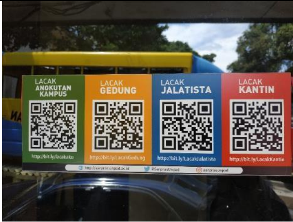
QR Code to track campus shuttle