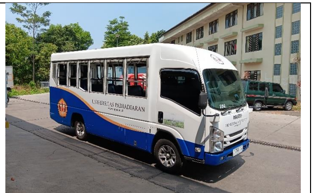
Isuzu NLR 55B LX (Euro 4 diesel vehicles)