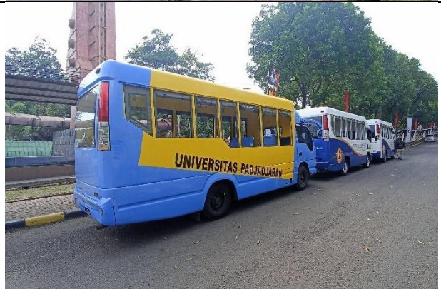
Campus Shuttle Queue