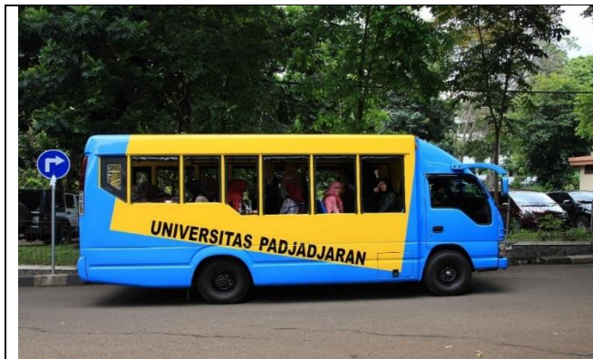
Isuzu NKR 55 CO E2 1 (Euro 2 diesel vehicles)

This campus shuttle is the best transportation asset currently owned by Unpad. Campus vehicles are regularly maintained and rejuvenated. Several campus shuttle units that have been operating for more than 5 years are regularly replaced with newer and environmentally friendly units. From 2010 to 2014, campus shuttle units were still procured using Euro 2 diesel vehicles. Starting in 2017, campus shuttle units were procured using Euro 4 diesel vehicles.