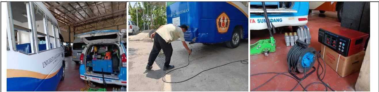
Campus Shuttle Emission Test

Starting in 2023, Unpad will begin collaborating with the Sumedang Toyota Dealer in order to carry out emission tests on Unpad inventory vehicles, including the campus shuttle. Several shuttle service units have been tested for emissions and all of them passed the test. This activity is scheduled to be carried out periodically as a routine program every 3 months in 2024.