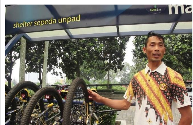
Bicycle shelter guards