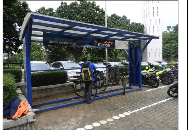
Bicycle shelter at Mesjid Raya Padjadjaran