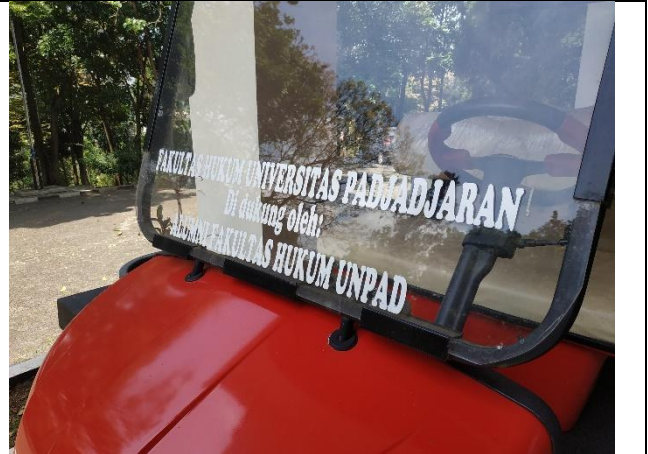
Example of Zero Emission Buggy