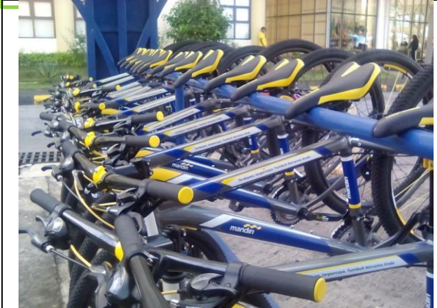
Example of Campus Bikes