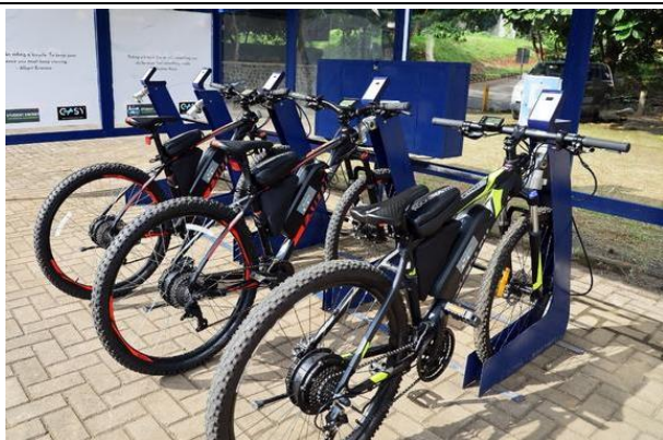
Solar electric bicycle (Easy bike)