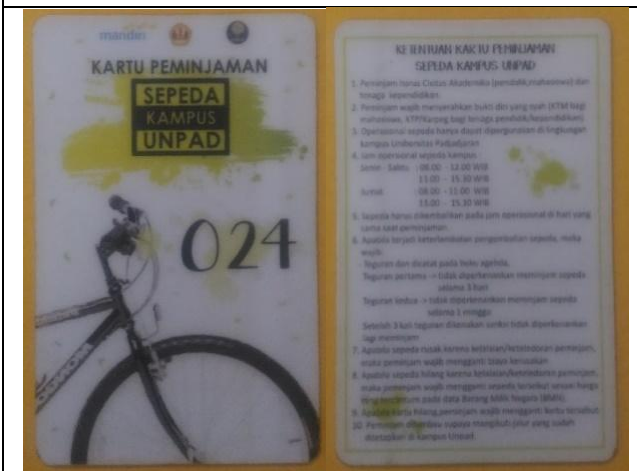
Bicycle lending cards