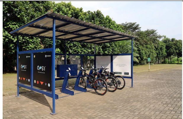
Example of Charging points for Solar electric bikes